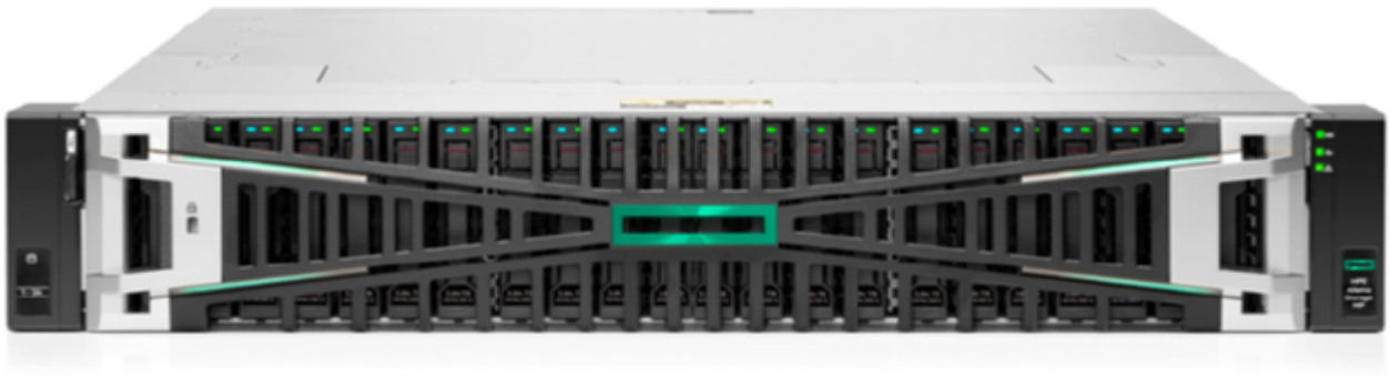
HPE GreenLake for Block Storage (2-Node all NVMe Storage Base)

HPE GreenLake for Block Storage brings mission-critical storage to the mid-range - delivering enterprise-class resiliency, performance, and scalability at an affordable price. Powered by the new HPE Alletra Storage MP hardware platform, HPE GreenLake for Block Storage is the industry's first disaggregated, scale-out block storage with 100% availability guaranteed. Get an intuitive, AI-driven cloud experience on-prem that simplifies management and shifts operations from infrastructure-centric to app-centric. Empower line of business with intelligent, self-service provisioning while managing and protecting workloads across your hybrid cloud from a single cloud console. Scale performance and capacity independently - and without disruption - with disaggregated storage. Meet every SLA with mission-critical storage that delivers an unrivalled 100% data availability guarantee. Accelerate your most demanding apps with consistently fast performance and ultra-low latency - even at scale.